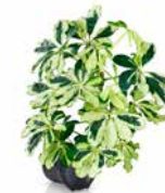
DWARF UMBRELLA TREE - SCHEFFLERA ARBORICOLA 'CHARLOTTE'