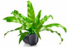
BIRD'S NEST FERN - ASPLENIUM ANTIQUUM