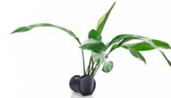
CAST-IRON-PLANT - ASPIDISTRA ELATIOR