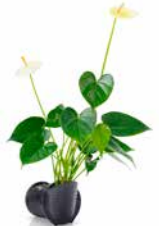
FLAMINGO FLOWER PAINTER'S PALET - ANTHURIUM 'VANILLA'