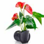
FLAMINGO FLOWER PAINTER'S PALET - ANTHURIUM 'BAMBINO RED' / 'ARISTO'