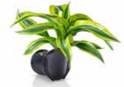
DRAGONTREE - DRACAENA DEREMENSIS 'LEMON SURPRISE'