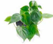
HEARTLEAF PHILODENDRON - PHILODENDRON SCANDENS