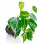
HEARTLEAF PHILODENDRON 'BRAZIL' - PHILODENDRON SCANDENS 'BRAZIL'