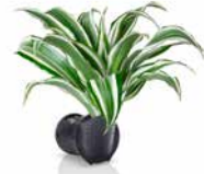
DRAGONTREE - DRACAENA DEREMENSIS 'WHITE JEWEL'

These three innovations combined create a Naava biofilter that naturally purifies air.