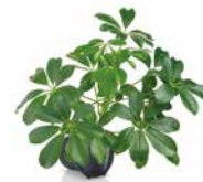
DWARF UMBRELLA TREE - SCHEFFLERA ARBORICOLA NORA