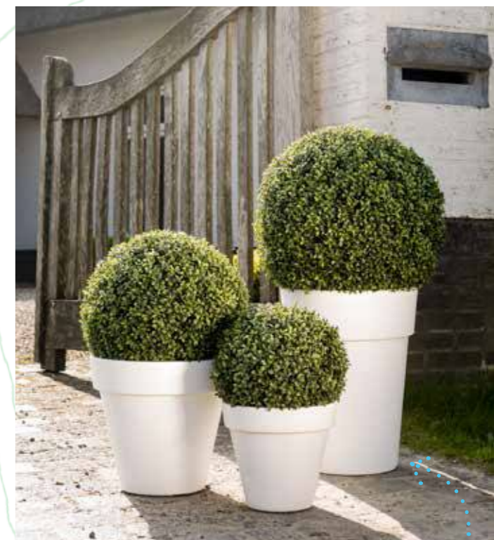
Boxwood balls. (Pots not included)