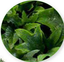
8EEHE7979 Hedera mat