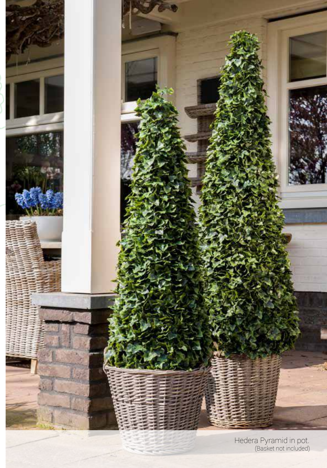
Hedera Pyramid in pot. (Basket not included)