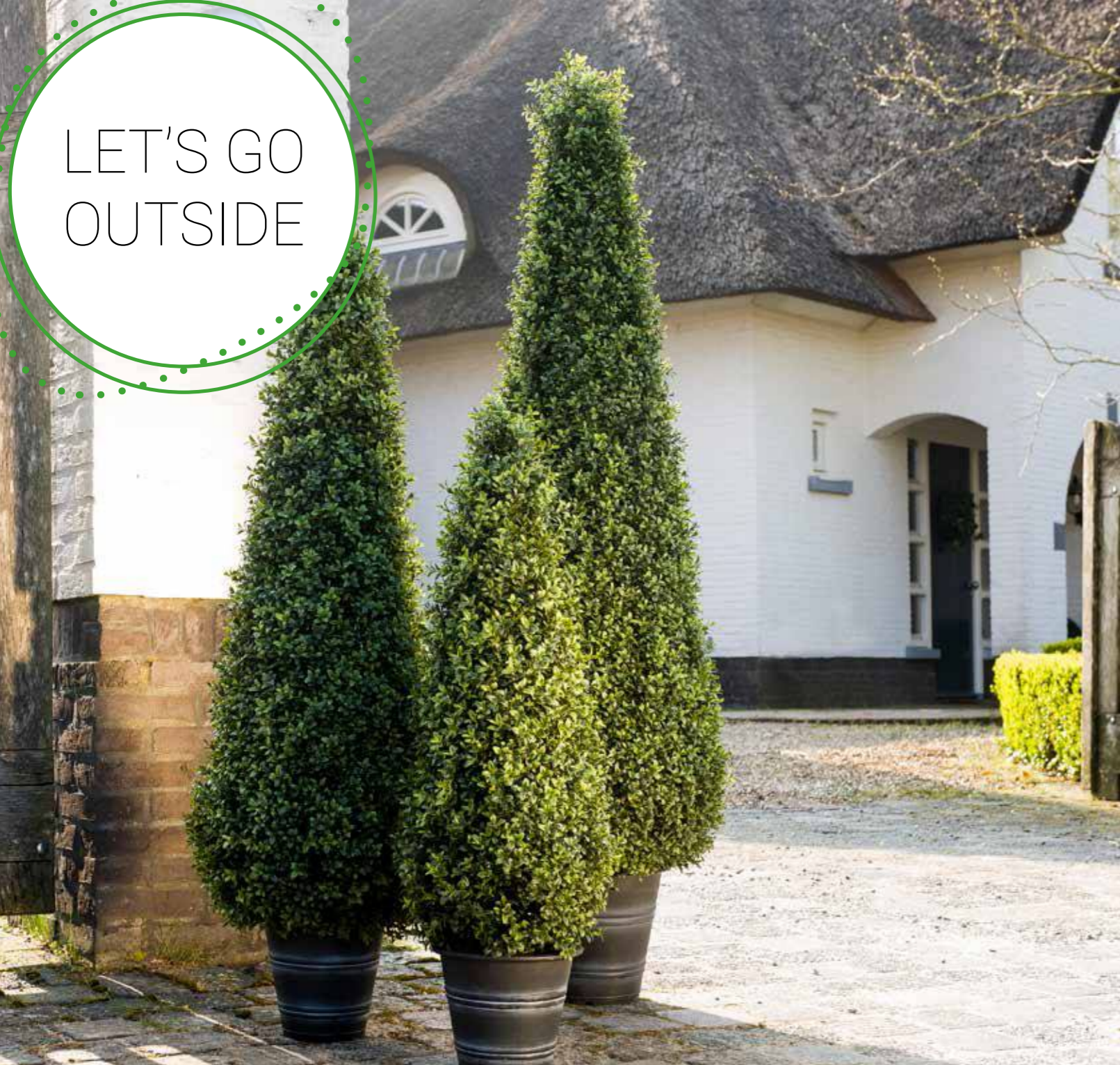
Boxwood Pyramid in pot.

So easy to maintain! Simply put the balls in a trendy pot to create a fantastic, eye-catching display for your garden or balcony.